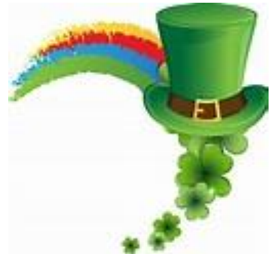
Primetime members gather for St. Patrick's Day themed meeting.

Table topics participants answered the question: "What do you do to celebrate St. Patrick's Day?" They shared about enjoyment of parades, beer gardens and some downright good fun! A great time was had by all.