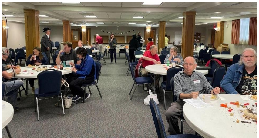
Club 229 anniversary celebration