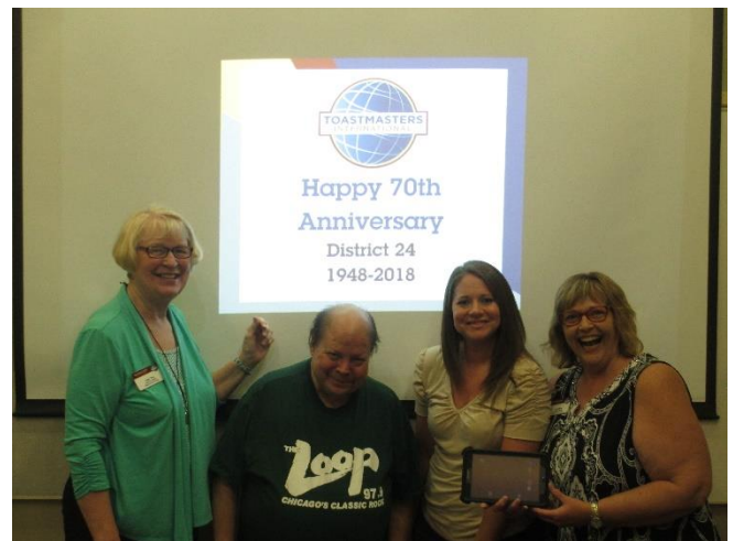
Area A3 Director and Assistants wishing District 24 a happy anniversary