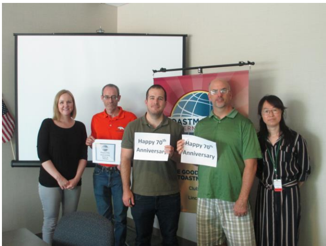
Good Neighbor wishing District 24 a happy anniversary