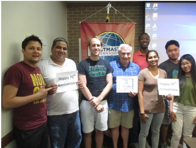
E.C. Speakers wishing District 24 a happy anniversary