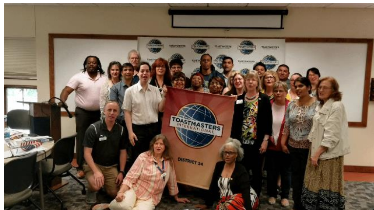
2018-2019 District, Division and Area Directors