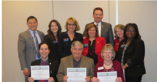
District 24 Trio at Toastmaster Midyear Training