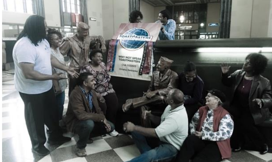
Committed to the Promise: Spring Conference Photo Contest Winner – Club Why Not Speak!