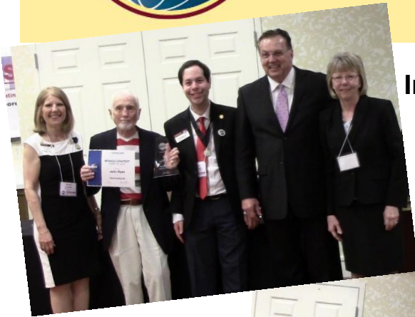
International Contest – 1 st Place