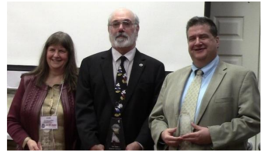
Tall Tales Contest – 2 nd Place, 1 st Place, 3 rd Place