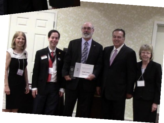
International Contest – 2 nd Place