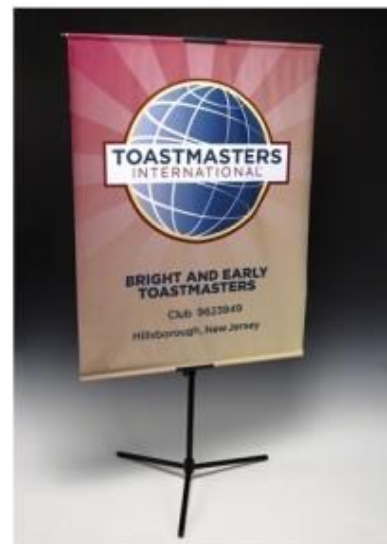
Toastmaster Branded Banner