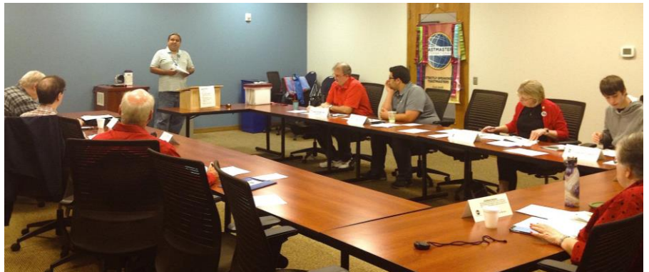
A recent Strictly Speaking Club meeting

distinguished guests provide great networking opportunities and insights into the district and international leadership roles. According to our recent member satisfaction survey, what our members like most about this club is the high-quality evaluations. We offer an in-depth round robin style of speech evaluations, where speakers receive both verbal and written forms of evaluation from every attending member. Additionally, our club provides extensive support towards navigating through the newly launched Pathways program. Our members include Pathways Guides who have conducted numerous Pathways training sessions throughout our District. Many have successfully completed one or more paths. They are great mentors and valuable resources to newer Toastmasters for receiving guidance in completing the advanced projects and fulfilling requirements for achieving the coveted Distinguished Toastmaster.