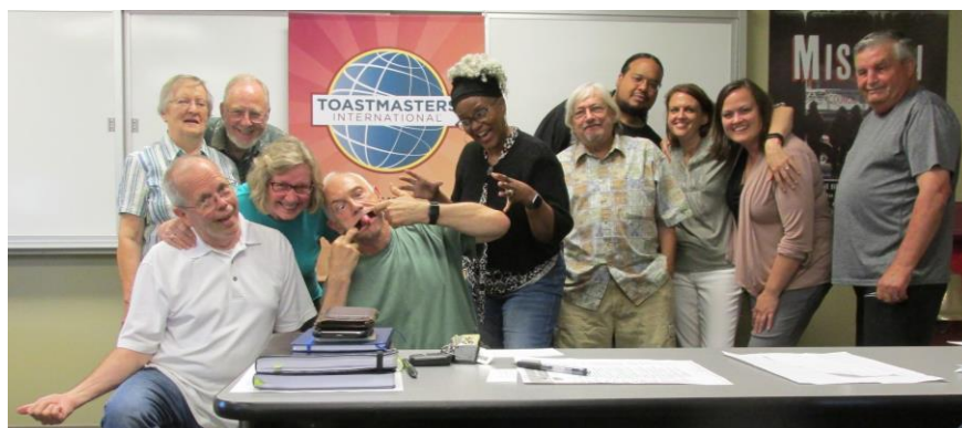
Greater Communicators Club, host of above events

https://www.facebook.com/events/815231725559937/