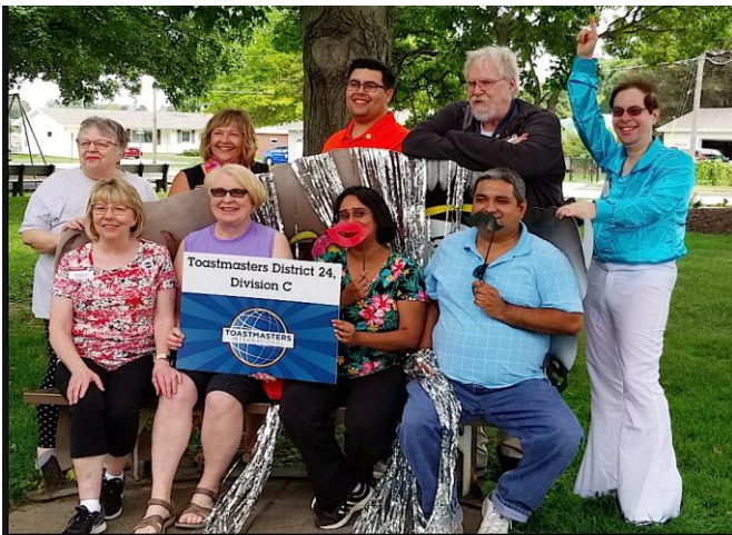
Strictly Speaking Club having fun at the District 24 year-end celebration 2019, in Gretna, NE