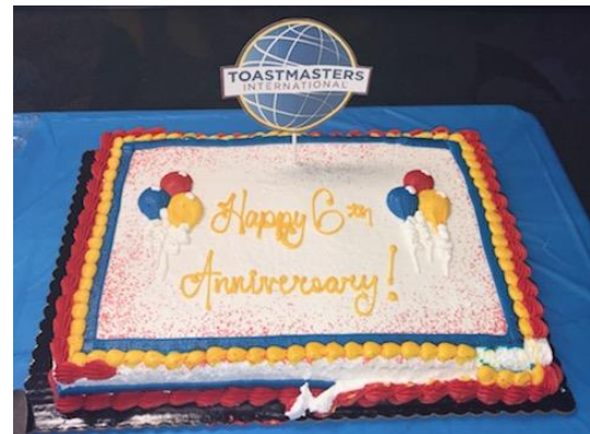
It's a wonder they weren't distracted by the delicious cake.